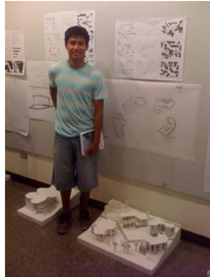
A student in Discover Landscape Architecture 2011

Discover Landscape Architecture is a design studio-based program, offering "hands on" experience in seeing and making the world in new ways. This program of instruction is intended for motivated students: it will be fun, engaging, and intense.