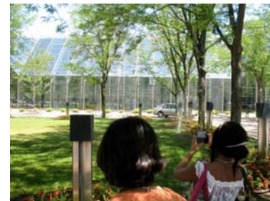
A student working on model making; color study of changing light in landscape; students on a class field trip to Columbus, Indiana

Studio & Seminars. In Discover Landscape Architecture , faculty and visiting professionals guide students in exploring their personal design process. During morning and afternoon sessions, students work on design exercises related to a comprehensive project. Films and slideshows introduce students to landscape architects, ideas, and projects. Evenings offer time for fun and discussion in a more informal atmosphere. Time is also devoted to learning about landscape architectural education, how to choose a university, and requirements for entering the profession. Individual instruction, field trips, small seminars, and periodic reviews culminate in a final presentation.